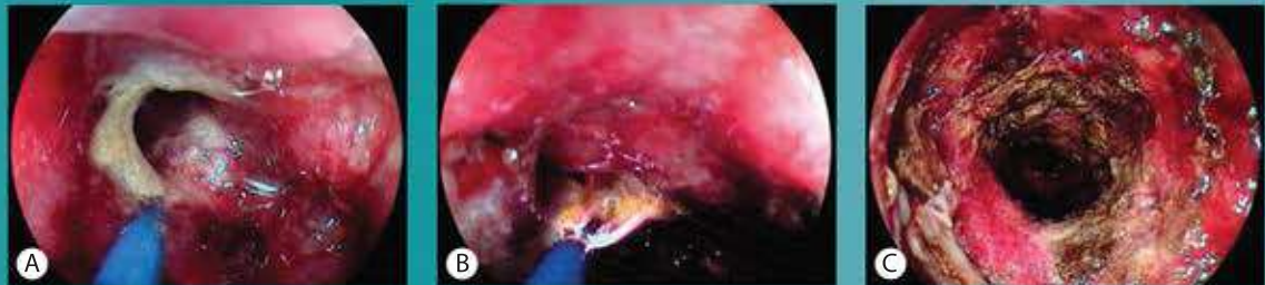
(A) Esophageal cancer pre-treatment. (B) APC treatment of the tumor. (C) Esophageal cancer following treatment.